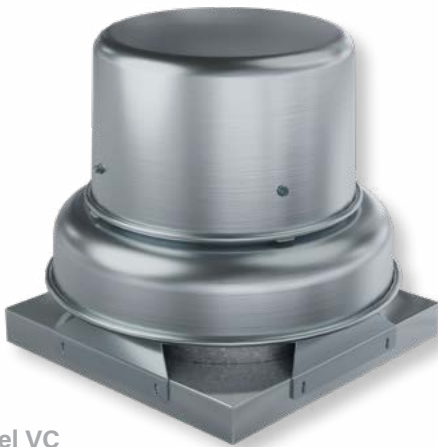
Model VC Direct Drive