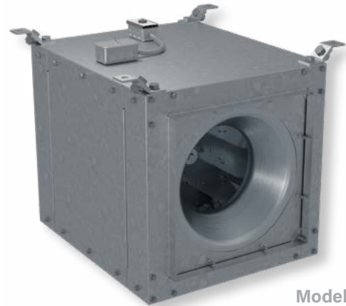
Model DSI Direct Drive