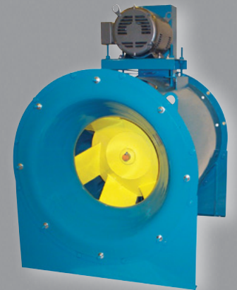
Model QSL/QSLR Mixed Flow Fans

Twin City Fan & Blower has the engineering and manufacturing capabilities to accommodate virtually every conceivable application. We have completed thousands of successful installations worldwide and have a proven track record for tackling the most technically complex and unique applications.